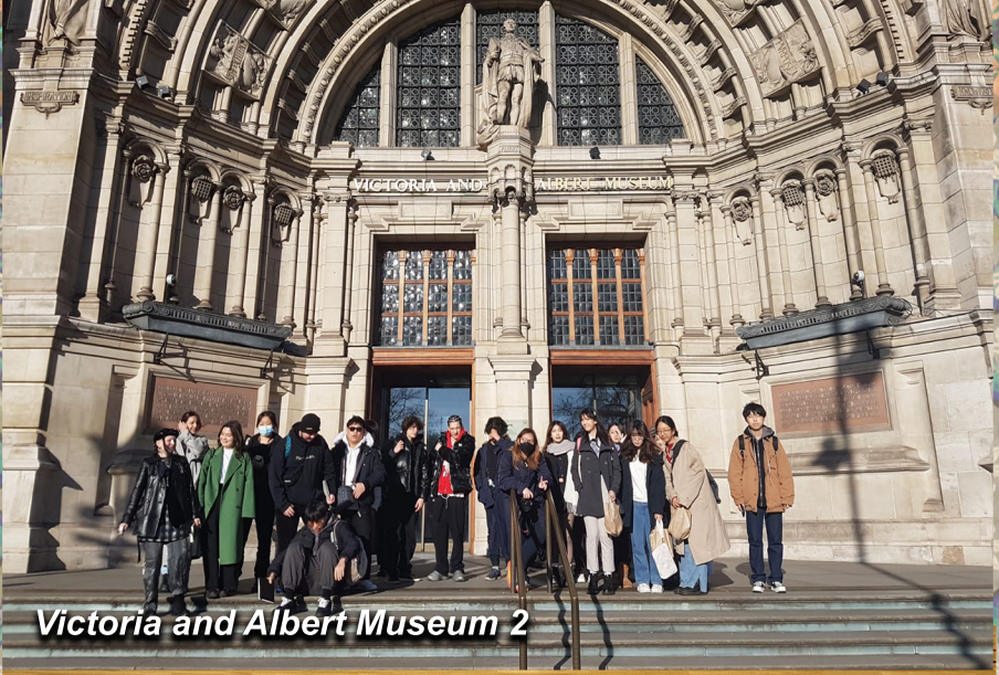
Victoria and Albert Museum 2