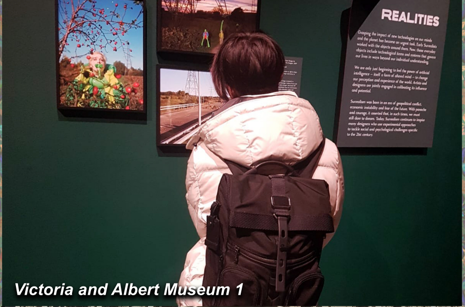
Victoria and Albert Museum 1