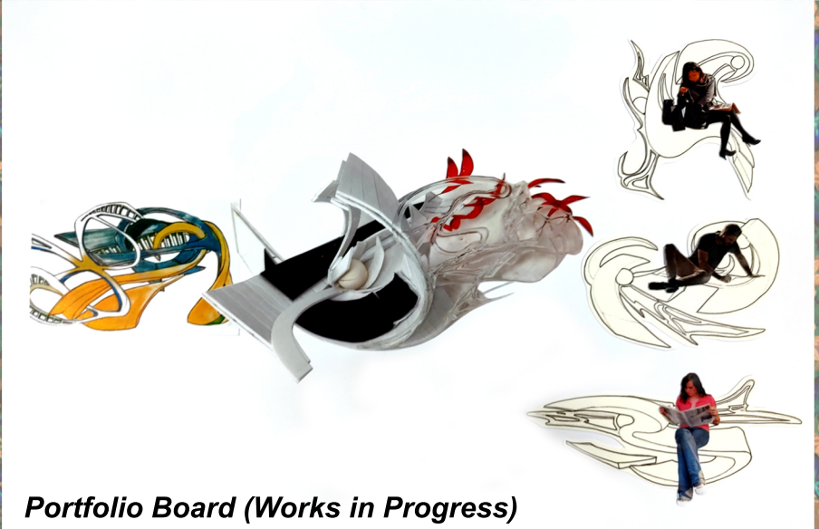
Portfolio Board (Works in Progress)