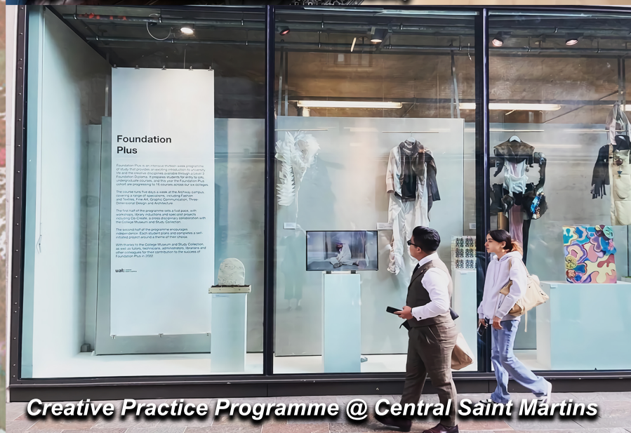
Creative Practice Programme @ Central Saint Martins