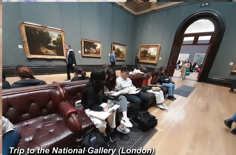
Trip to the National Gallery (London)