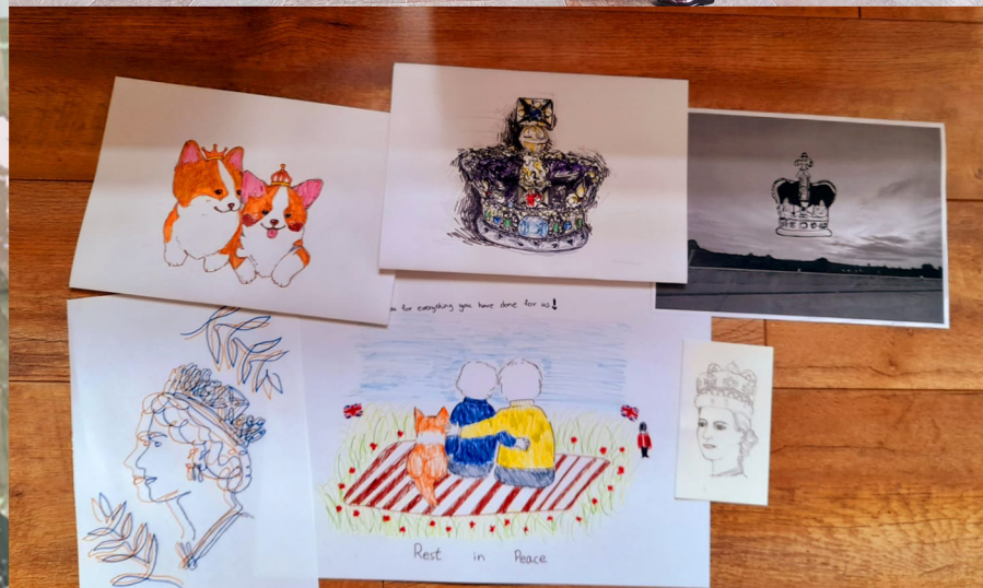
Tributes to HM Queen Elizabeth II