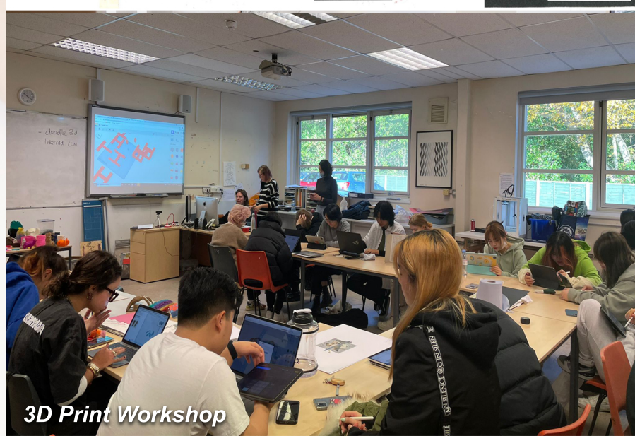
3D Print Workshop