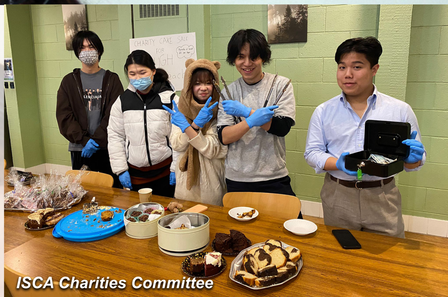
ISCA Charities Committee

Following investment in a new 3D printer, the focus of a recent specialist workshop was on how to develop 3D skills. Students were impressed by the many possibilities after studying prints produced with materials ranging from resin and wood to copper and steel. They were able to design and plot at least one 3D form inspired by their research and enjoyed observing how these could be realised.