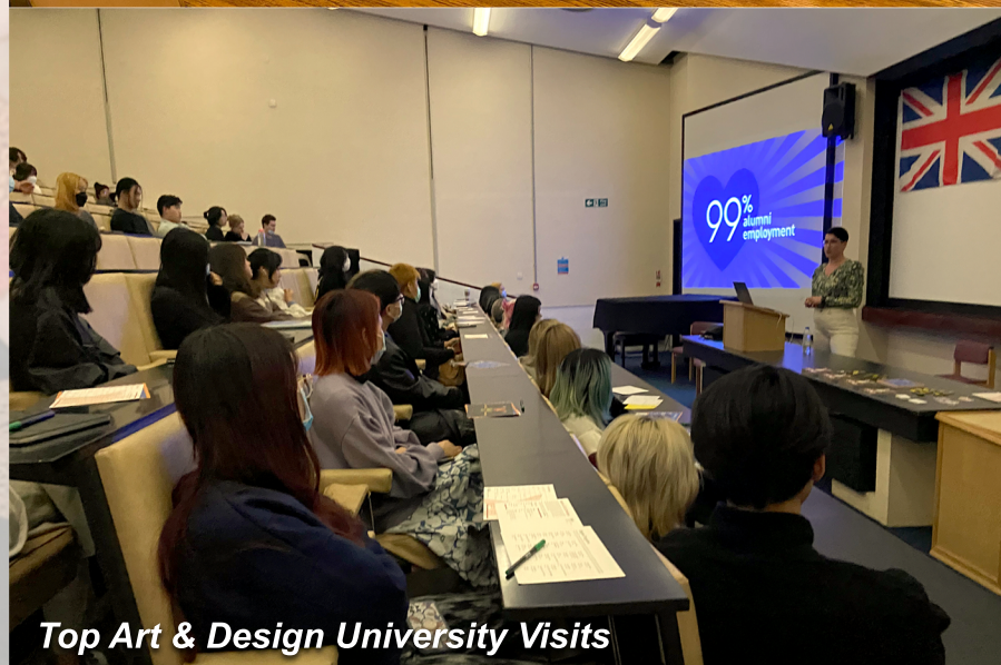
Top Art & Design University Visits